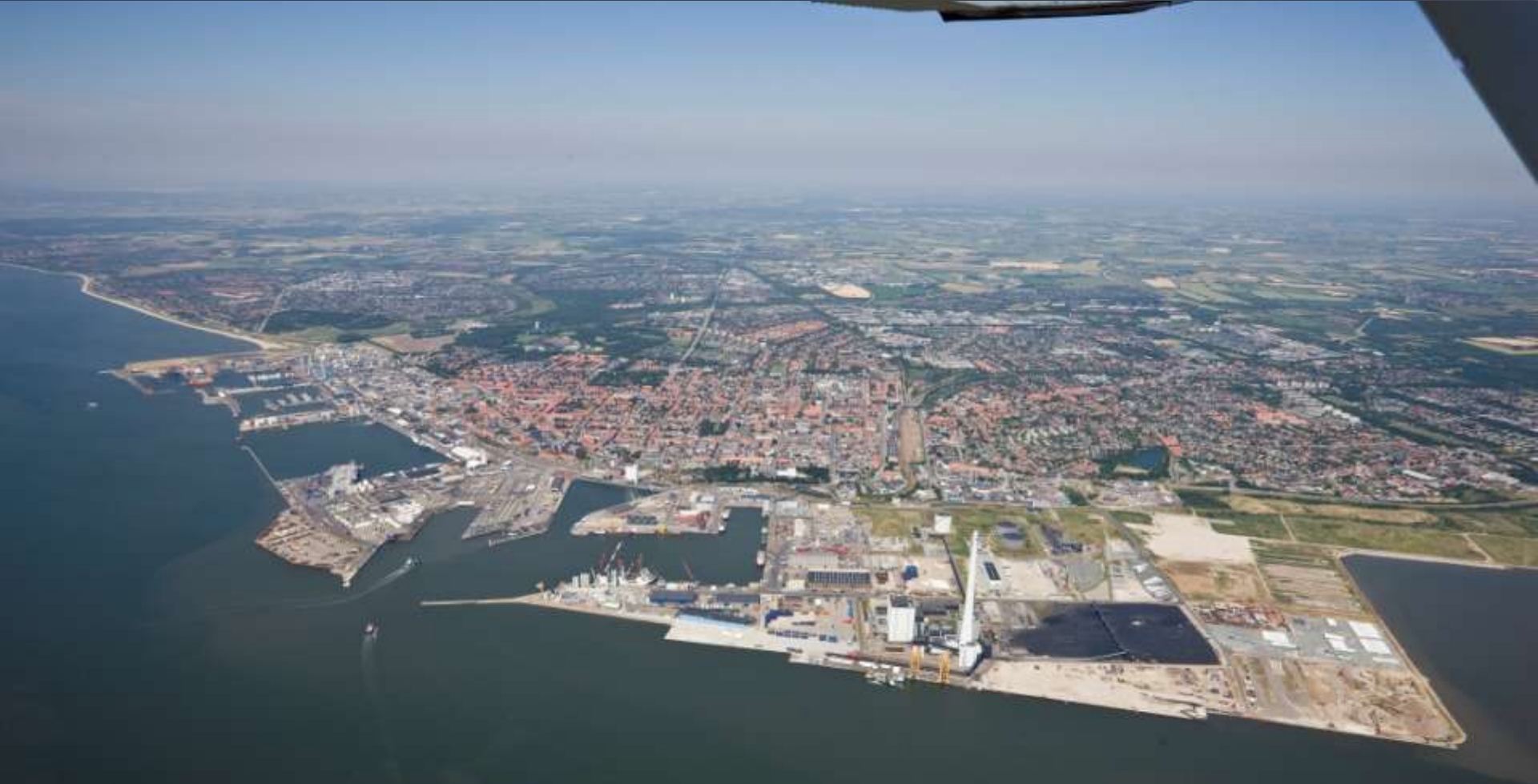
Port of Esbjerg